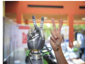
Explore new knowledge