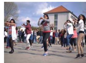
Join a student club