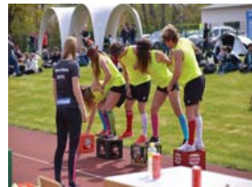
Enjoy student events