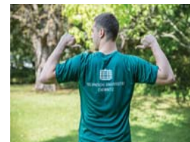
Have a GREAT time